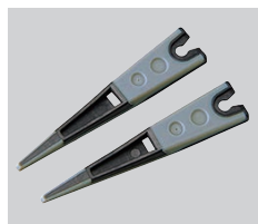
Replacement tip (401-063)